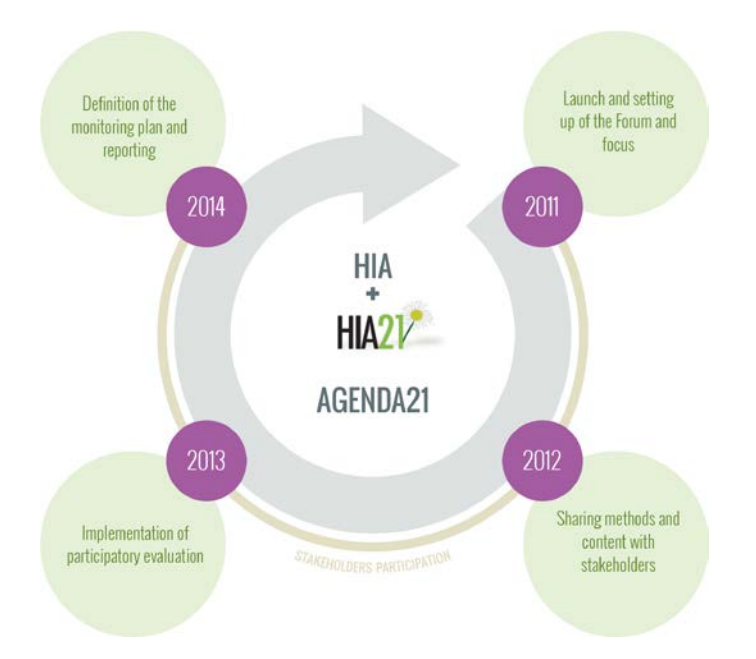
Figure 1. The HIA21 project: processes and participation stages